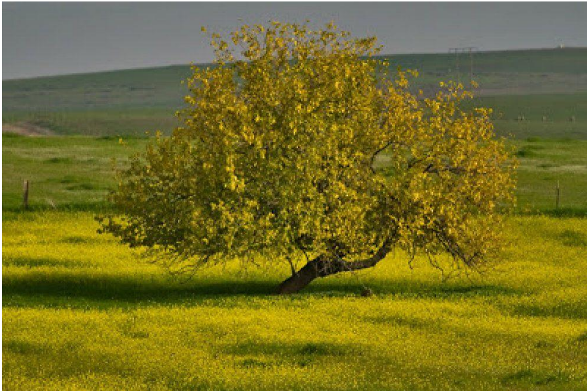
Mustard Tree in Israel