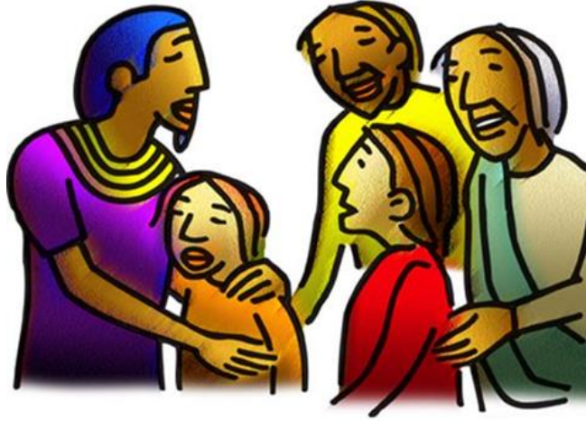
Joseph reuniting with his brothers

Do you think of me as enemy, and could you call me friend, or will we let our differences destroy us in the end?