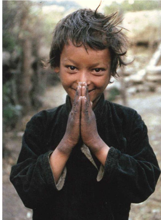
Boy offering a greeting of namaste (the god in me sees the god in you) Nepal; photo by Cora Edmonds