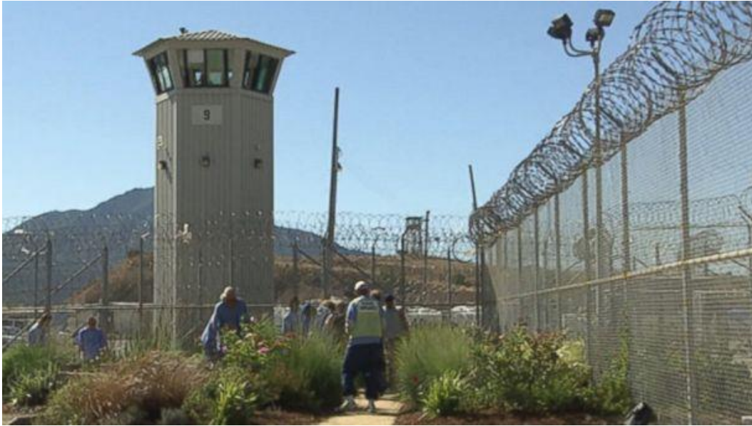
Prison gardens growing new lives for inmates at San Quentin