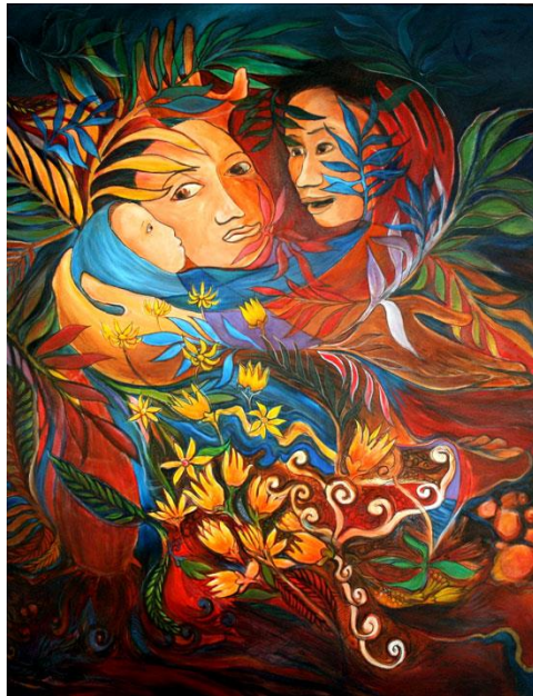
Erland Sibuea, Nativity , Indonesia, 2008