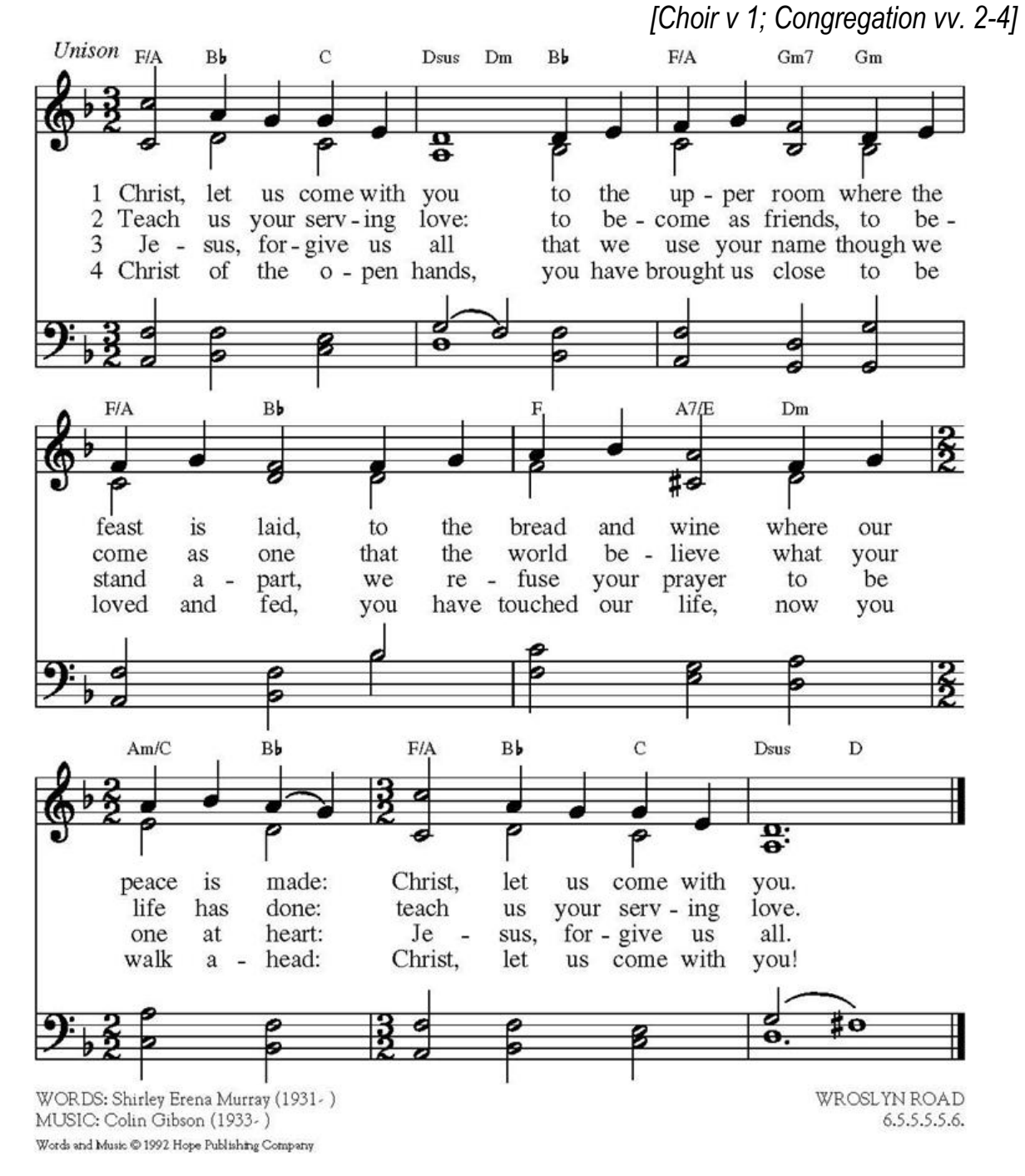
Christ, Let Us Come with You